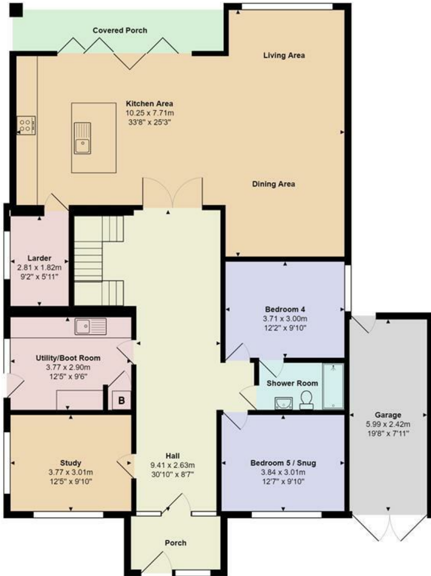
PROPOSED GROUND FLOOR